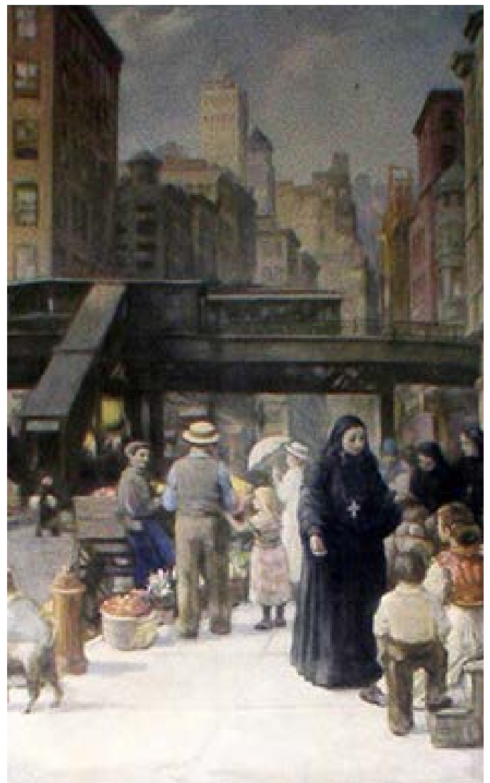
SAINT AMONG THE SKYSCRAPERS

Italian farming family, often sick, hungering to be a missionary in China. What was so unbelievable was not her upbringing but what followed. She came from a rich faith-filled background that made her never give up, getting to meet with Pope Leo for advice on missionary work and he opened her eyes to the need for missionaries in the New World, and off she went. "Often sick" didn't matter as the fire of Christ's love burned in her and helped travel throughout Europe and across the United States and to Central and South America. In the next three decades, she established 67 schools, orphanages, and hospitals, 3 of which were here in Chicago. She would cross the Atlantic 24 times to work to recruit women to join her Missionary Sisters of the Sacred Heart of Jesus and to fundraise to build institutions to help not only Italian immigrants but anyone who came to the doors of